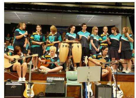
Participants in the Year 12 song performance.