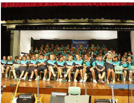
Our departing Year 12 students for 2007