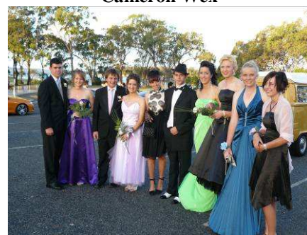
Friends enjoying the School Formal