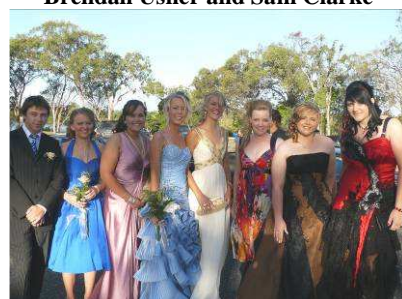
Ready for a great evening