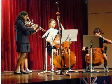
Silver Strings performance