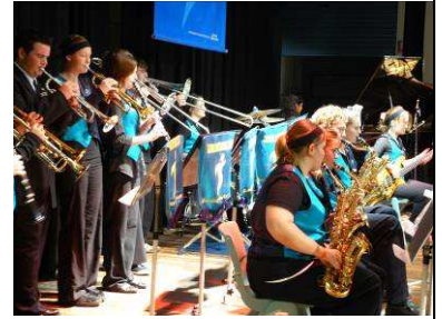
Stage Band performance

Wednesday 31 October saw all the year's hard work recognised at the 2007 Awards Evening. The parents and invited guests were entertained by our stage band, strings and Drama students.