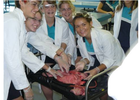
Our Senior students participated in a 'hands on' Biology lesson on lung function.

As a major part of there assessment, students planned and prepared a themed luncheon. This year themes included an Oriental and Fifties Rock & Roll themes. Invited guests and fellow students enjoyed a lovely two course meal in our dining room. The room was decorated and the waiters dressed in accordance with the themes. Students are to be congratulated for a wonderful dining experience, and great enthusiasm for their subject.