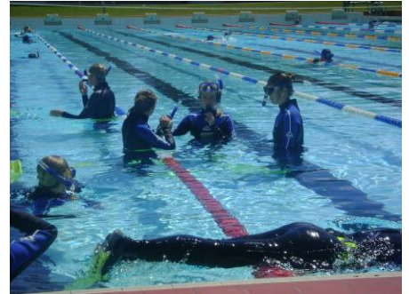
Year 11 students participated in Snorkelling lessons last week. See inside for more info.