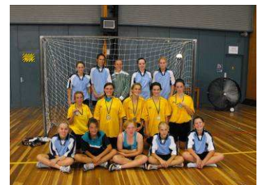
Our Futsal girls who triumphed recently in Gladstone.