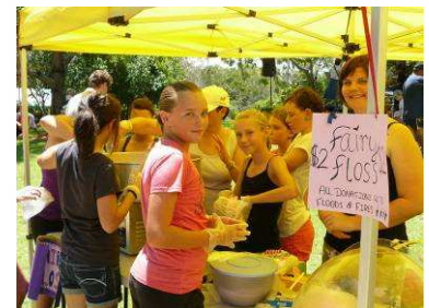
Tannum students helped out to raise $250 for the Victoria Fire and Queensland Flood victims at Millennium recently.