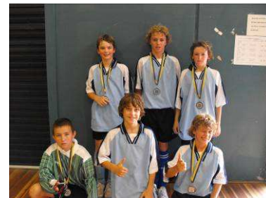
(above) Year 8 boys Futsal team members (below) Year 10/11 Futsal action.