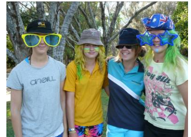
Tune in to next weeks Newsletter for all the fun from Beach Bash