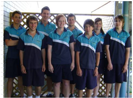
These TSSHS students greatly benefited from the information by Engineering Link