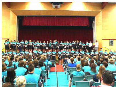
2008/2009 Mentors received their certificate from Councillor Maxine Brushe