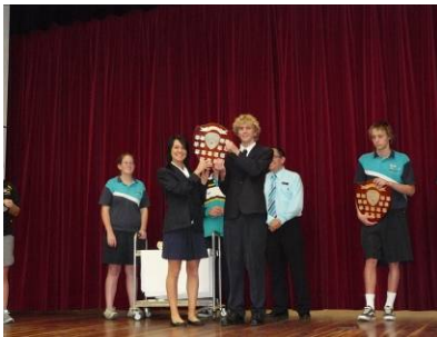
Whoolghun House Captains receive the Champions Athletics Trophy for this year.