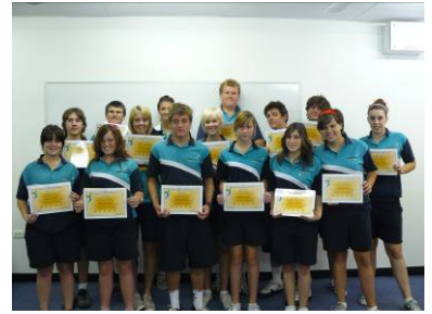
GOLD CARD AWARDEES

Please find enclosed as an insert school term dates and holidays for next year.