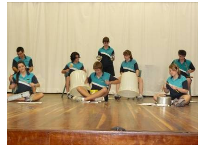
"One and a Bang Bang" performed by the Percussion Ensemble