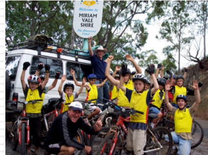
Chappy's Bike Team See inside for details

Do students need to attend this week? ABSOLUTELY! Teachers have been instructed to commence term 3 work once all assessments have been completed.