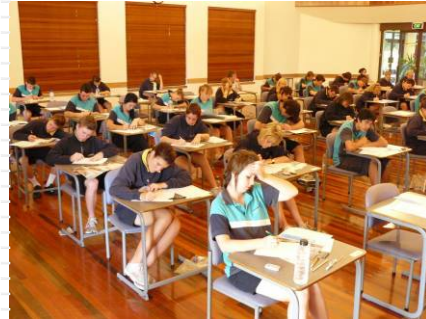
QCS Practice Testing for Year 12's