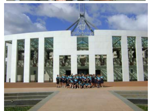
Our 2008 Year 9 students went to Canberra in December.