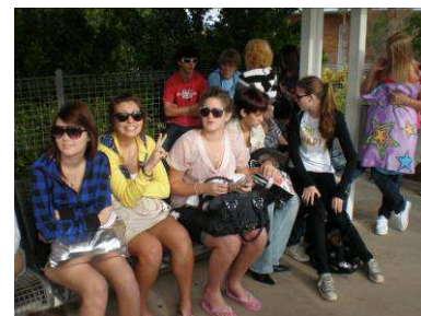
Gladstone train station waiting to go