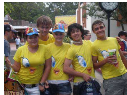
Students at Movieworld

It was a great experience which gave many students a new appreciation for the wonderfully diverse nature of the performing arts, community and each other.