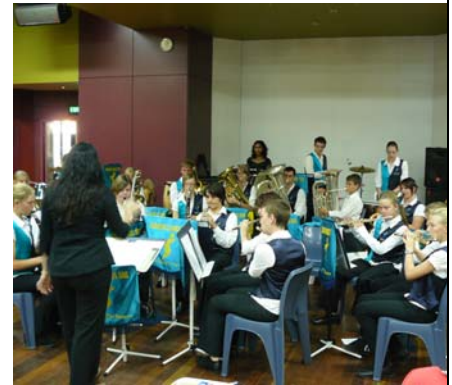
Our Orchestra and Stage Band “wowed” the audience with their performances