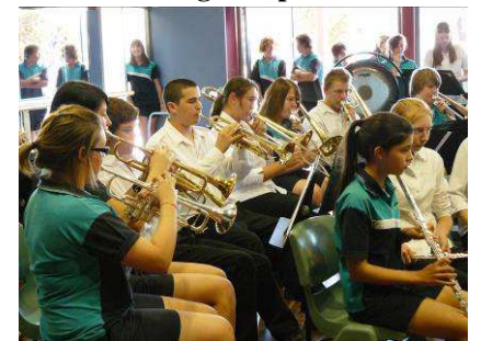
Toogoolawah State School visit Read more about the visit inside.