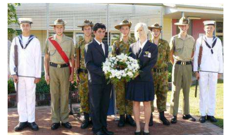
Our Cadets and Captains