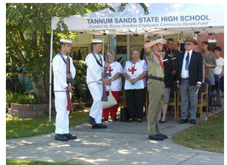
TSSHS Anzac Day Service