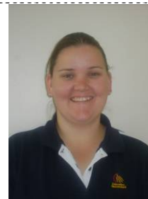
Godwyn Science & Maths